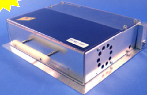
ABT-1000 Burn-In System